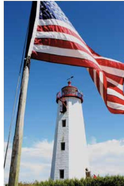
Virginia Baltay Guilford, CT