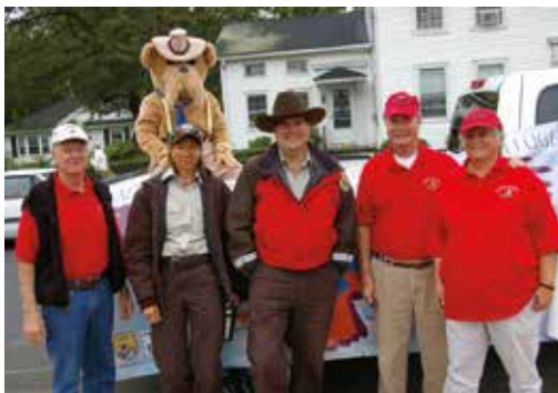
TR Bear, USF&WS and FLB Parade gang

TR Bear, a cuddly figure that sports a Rough Rider cavalry hat and bandana, as well as the famous Roosevelt moustache, is a great character to represent the US Fish and Wildlife Service. He represents not only America's great conservation president, but also the wildlife that TR attempted to protect more than a century ago. It was great fun to portray him, and I am pretty sure that the people of Guilford (as well as Governor Malloy) enjoyed meeting him. Hopefully TR Bear will be available for this year's parade too.