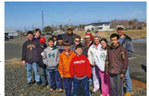
BSA Troop 474 overnight on Faulkner Island

Guilford Boy Scout Troop 474 had the unique opportunity of going out to Faulkner Island for an overnight stay April 15-16, 2013. They were invited by the US Fish and Wildlife Service (USF&WS), who own and maintain the island as a wildlife habitat. During their stay on the island the scouts helped with the preparation for the arrival of the Common and Roseate Terns in May 2013 and the removal of debris from Tropical Storm Sandy. The scouts were transported to and from the island on the USF&WS Landing Craft.