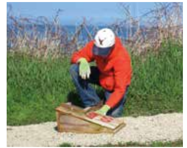
Volunteer installing nesting boxes

The Refuge wildlife biologist has received a grant to create more roseate habitats on the island and has targeted the upper northern tip as a desired location. This area is high enough to avoid much of the storm erosion and has a history of being a roseate tern nesting spot. Refuge staff and volunteers will cut back the vegetation, put down weed blocker in strips, and cover it with pea gravel of just the right size and shape for the roseate terns. They will also set up nest boxes to protect the birds from predators and monitor the area all summer long.