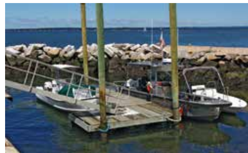
FLB VIP boat and USCG Vessel in basin

droppings from the thousands of terns on the island for the summer. FLB was busy cleaning the blackboard and floor in the boathouse from the birds. Once the blackboard dried, it