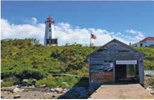
A glorious Open House on Sunday

September 3 rd was a busy one on the island. USF&WS had their work cut out for them with mowing 5 feet of vegetation. Stairs and other areas needed to be cleaned of bird