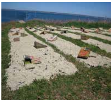
New pea gravel and nesting boxes for the Roseate Terns

The island is shaped much like a mesa or plateau with a lower tier of rocky beaches and rip-rap, an upper level that is composed of grass and shrubs,