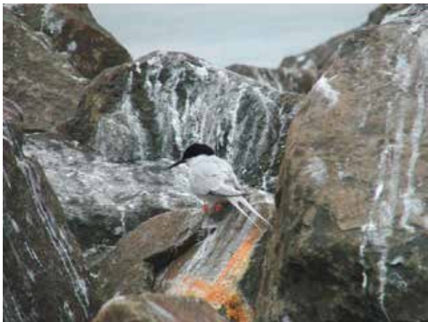
Roseate Tern