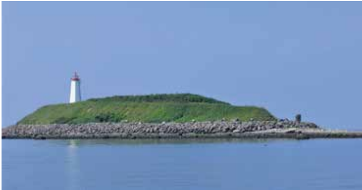
The north spit and east side of Faulkner Island.

Although Sandy created a high quality piping plover and reduced the tern habitat on the Milford Point Unit of the Stewart B. McKinney National Wildlife Refuge, the super storm was also responsible for the destruction of prime roseate tern nesting habitat on the northern spit of the Faulkner Island Unit. The roseate tern is a federally endangered species which breeds in only one place in Connecticut... Faulkner Island. The north spit has historically been one of